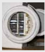
Swimming pool filter