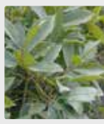
Plants and turf